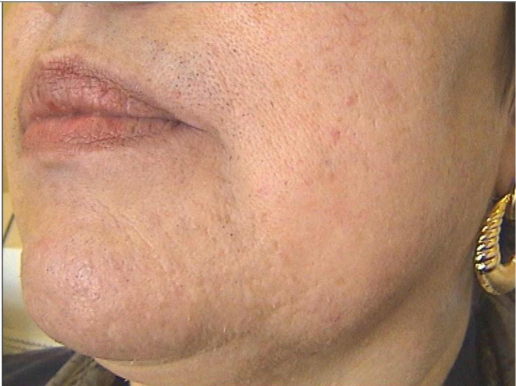
Left side following 3 treatments with diode (808)