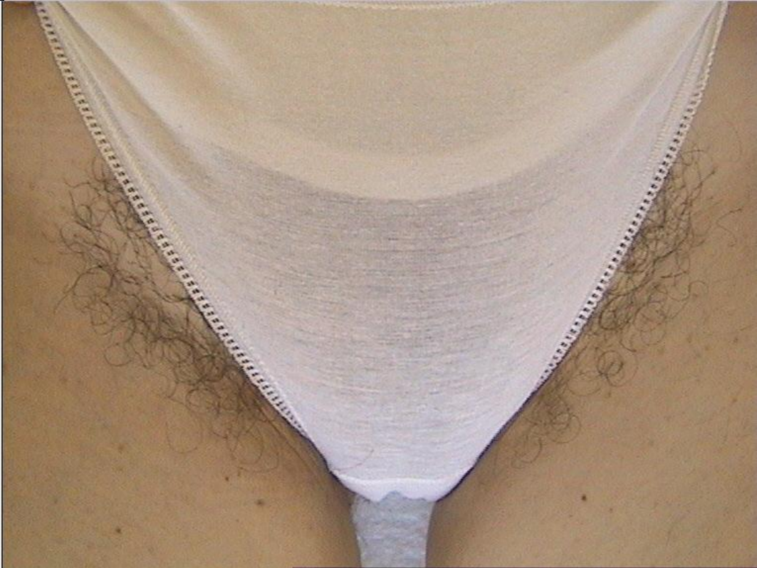
Initial condition – Treatment - Diode miXT (808 + 938) Patient right side – Diode (808) Patient left side