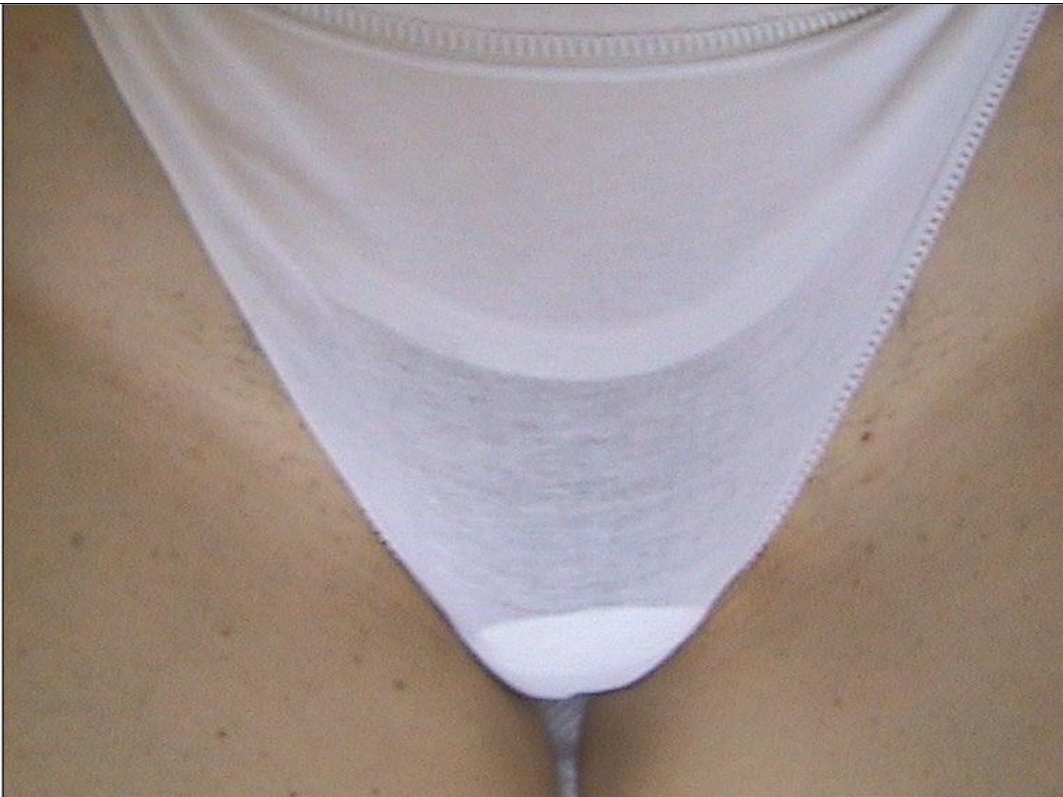
Result following 4 treatments - Diode miXT (808 + 938) Patient right side – Diode (808) Patient left side