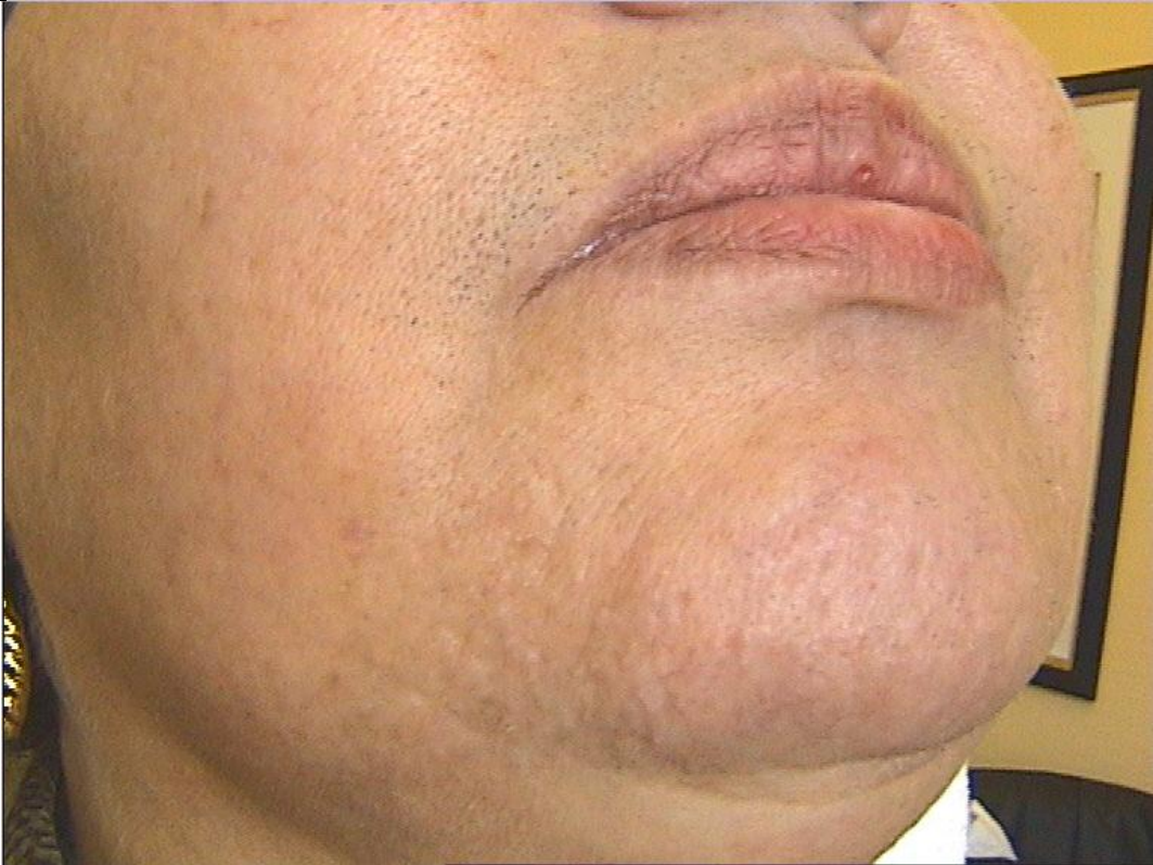
Right side following 3 treatments with diode miXT (808 + 938)